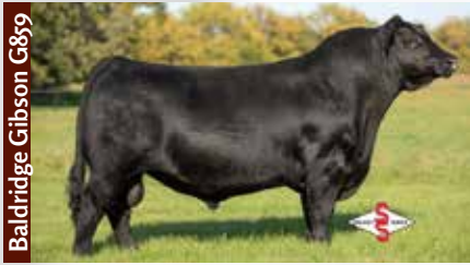
Baldrige Gibson G859

We purchased Yon Sarah F482 with this calf at side. He is sired by Baldrige Gibson G859 and his Maternal Granddam is Yon Sarah A100, the dam of Yon Full Force at ABS.